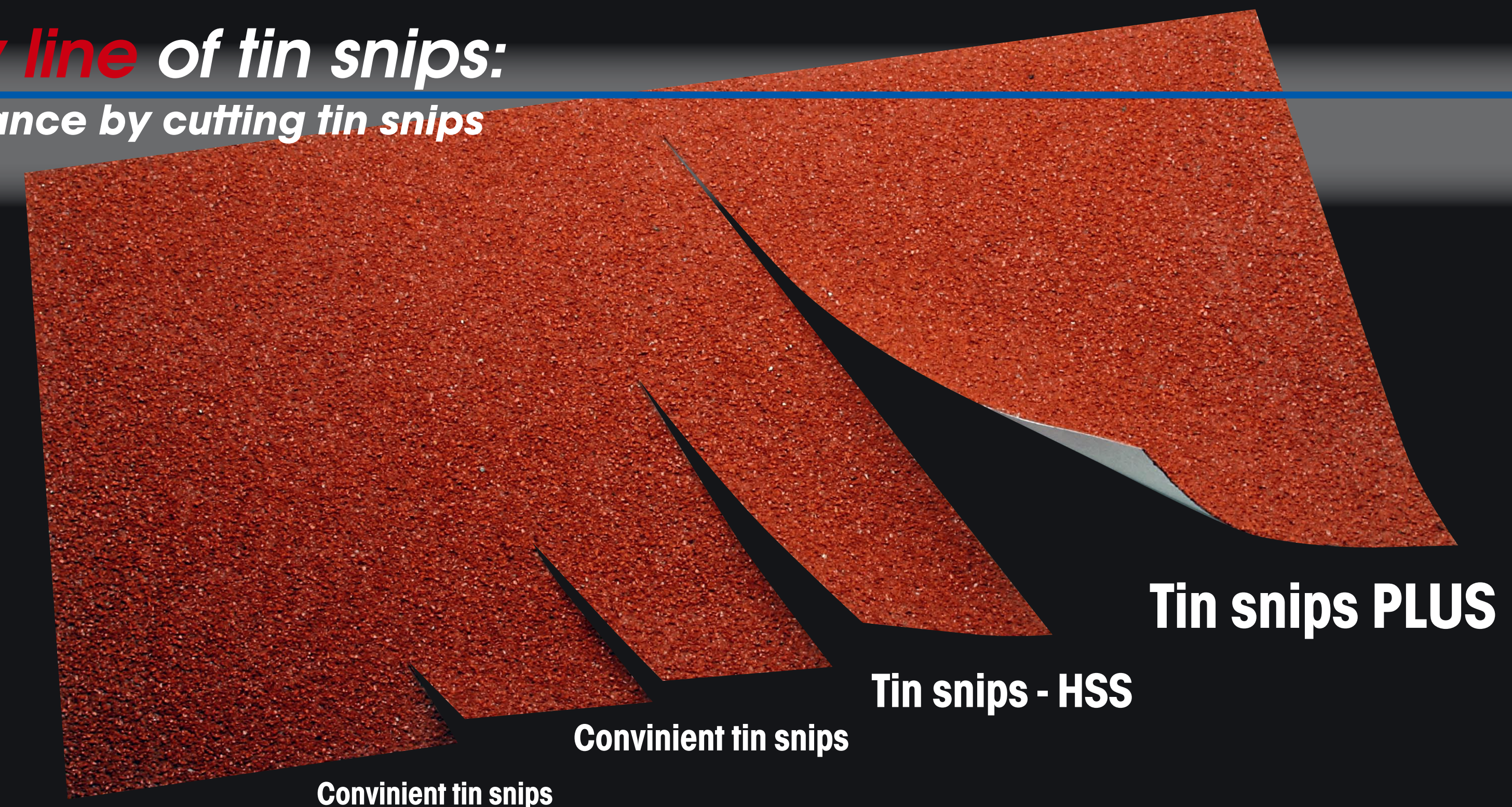
Convinient tin snips